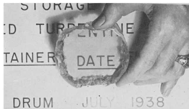
Fig. 3—This rosin was WG grade, having a cleanliness of about 96%. This represents the brightest rosin obtainable from cleaned gum