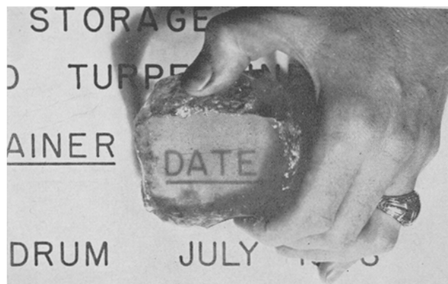
Fig. 1—This rosin was WG grade, having a cleanliness of about 57% and with some noticeably large trash particles of "pebbly" appearance. This rosin would not be accepted on the market

Rosin containing a noticeable amount of trash, which heretofore has been known as "circled" rosin, is no longer acceptable on the market. This exclusion was brought about by "loan" stipulations and a desire to place a better product on the market. A second step toward better rosins has been taken by the Naval Stores Station which aims to produce a rosin that is free of the "haze" due to fine trash particles that are almost microscopic in size. This can be done by cleaning the gum by filtration and washing before distillation, and can be approached by careful straining of fire-still rosin, using a high grade and heavy cotton batting.